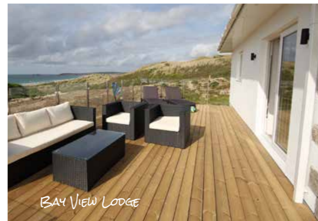
BAY VIEW LODGE