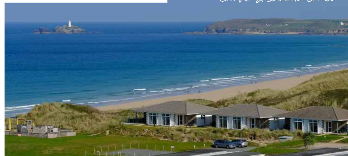
BAY VIEW & SEAFRONT LODGES

Our unique, one-off bay view lodge offers a beautiful, unique location right at the front of the park. The bay view lodge has its own extended decking with panoramic views from St Ives Bay right around to Godrevy lighthouse and stands just metres away from the golden sandy beach at the front of Beachside.